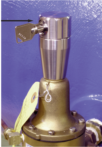
X140-1 Locking Security Cap