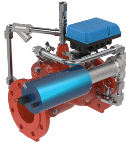
Actuated hydraulic pilot CPC-34