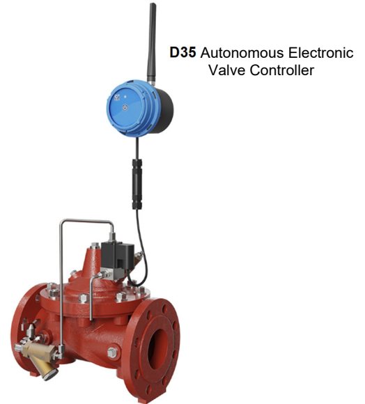
D35 Autonomous Electronic Valve Controller

CLA-VAL SERIES D35 switches a latching solenoid by means of a CLA-VAL D35 autonomous electronic valve controller, according to predefined time, flow, level and/or pressure rules, or upon remote command.